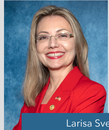
Larisa Svechin Mayor

“ Our City Charter is the founding document for Sunny Isles Beach. It is our citizens’ bill of rights, defines our form of government and city boundaries, and outlines how the city administration and legislation should be run. ”