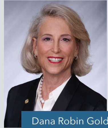
Dana Robin Goldman Mayor

“ Traffic safety and enforcement remains a number one priority for the City of Sunny Isles Beach and our stellar Police Department is stepping up in a big way. ”